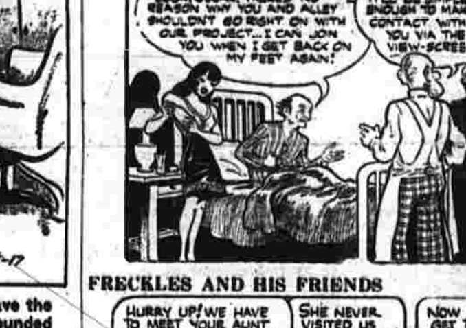
FRECKLES AND HIS FRIENDS